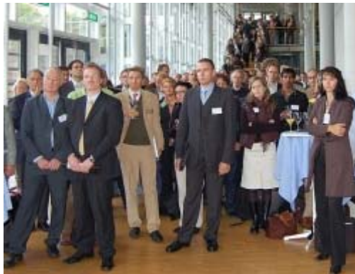
Guests at the Audimax foyer for the lunchtime reception.